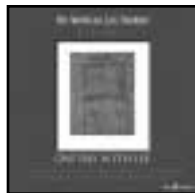
One Day with Lee