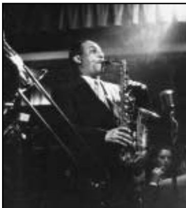
Johnny Hodges, 1961