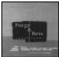
Porgy & Bess ...Redefined!

See The AJI Record Store for descriptions of all of our critically-acclaimed CDs. Order by mail or online at www.amjazzin.com . Better yet, join AJI and choose up to 3 current releases at no cost.