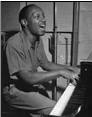
Tadd Dameron, circa 1947

Saxophonist Tom Scott's professional career began as a teenager and evolved into a high-demand session musician. He has dozens of solo recordings for which he has collected thirteen Grammy nominations and three Grammys. His numerous film and television scoring credits include theme songs for The Streets of San Francisco and Starsky and Hutch . Tom has appeared on records by such diverse artists as George Harrison, Whitney Houston, Joni Mitchell, Steely Dan, Quincy Jones, Carole King and Frank Sinatra.