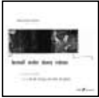
Farewell Walter Dewey Redman