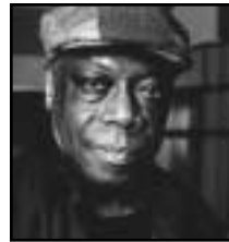
Andrew Cyrille January 21