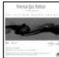
The Clifford Brown Project