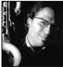
Gary Smulyan January 14