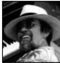
Roger Kellaway January 16